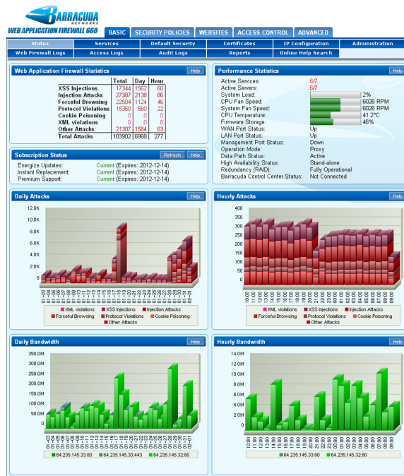
The Barracuda Web Application Firewall Vx monitors and tracks common application attacks, performance statistics and bandwidth usage.

It is simple to remotely download and install the Barracuda Web Application Firewall Vx in virtual environments. Default policies deliver instant web application security at deployment. A dashboard gives visibility into web app and threat activity. For further ease of use, security policy templates for Oracle, OWA, SharePoint and others simplify administration while Barracuda Energize Updates automatically update firmware and threat profiles. Reverse proxy security, a load balancer, caching, user authentication, data compression, SSL acceleration in one VM appliance simplifies DMZ architecture. Furthermore, the Barracuda Web Application Firewall Vx's intuitive GUI makes monitoring, management and reporting fast and easy.